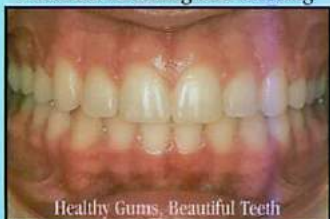
Healthy Gums, Beautiful Teeth